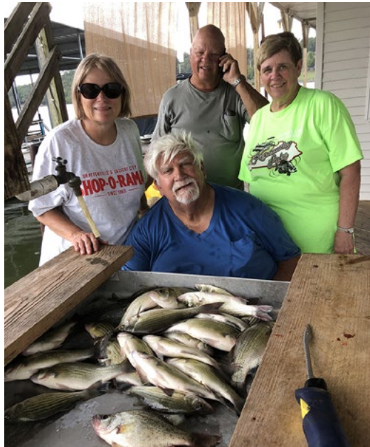
The Nishwitz group from Collinsville, IL